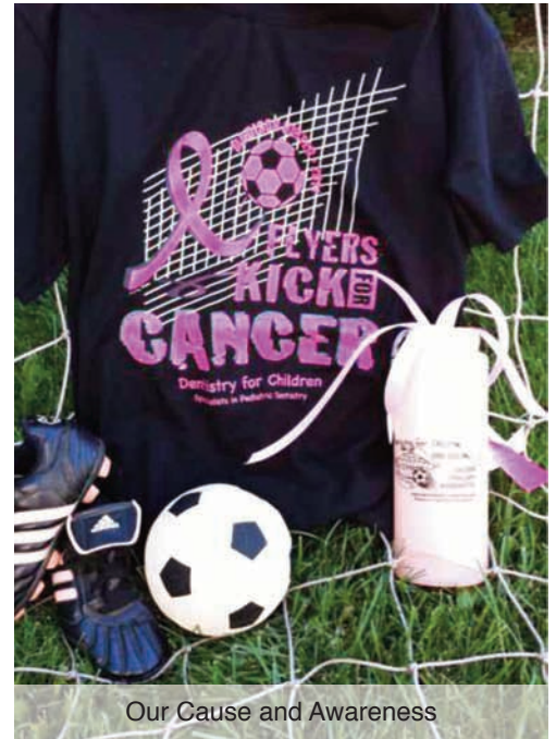
Our Cause and Awareness

Today's youth sports are dominated by the drive to train tomorrow's super athletes. Youth sports teams are often judged not by the character on and off the field but by the teams win loss ratio. Young athletes look towards the next practice, game, and how to win. Few players look beyond their own needs and the needs of their team.