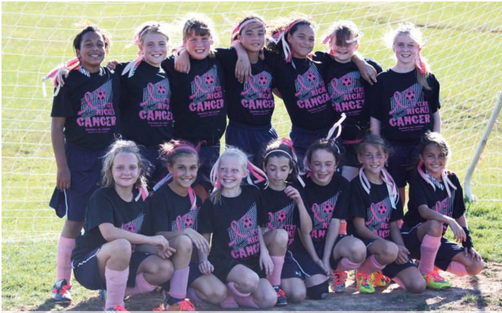
14 member squad of Madison United Soccer Association 01 Girls Select Flyers