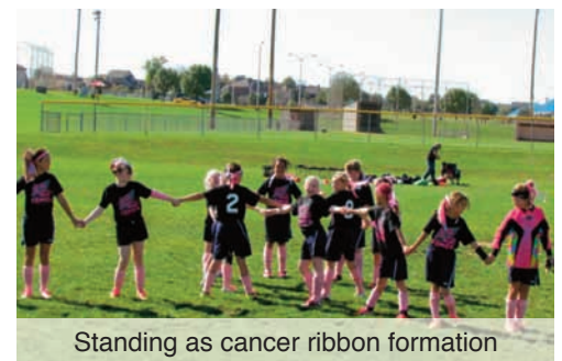
Standing as cancer ribbon formation

end of September, the girls raised over $1,300 for the Saint Joseph Breast Center and the Susan G. Kohmen foundation. Many of the players know or are related to someone who has/had been directly affected by one or more types of cancer. Breast Cancer stood out to the girls and parents as a way to help find a cure but also to create a way to have the conversation about early breast cancer detection. Swapping out their normal team jerseys for black and pink t-shirts, the girls played the first annual Kick for Cancer dedication game on Sunday, October 16th against the Atletico Flames from Elizabethtown. In an extraordinary display of sportsmanship, all parents and players