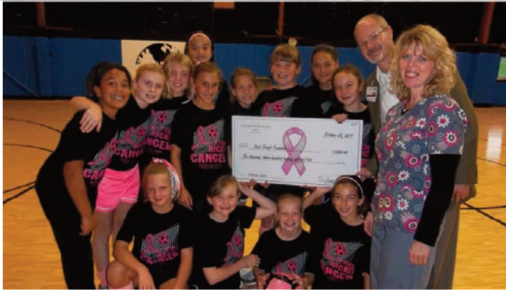
MUSA 01G Girls presenting the check for over $1300 to Representatives from St. Joseph Hospital Cancer Center

Today's youth sports are dominated by the drive to train tomorrow's super athletes. Youth sports teams are often judged not by the character on and off the field but by the teams win loss ratio. Young athletes look towards the next practice, game, and how to win. Few players look beyond their own needs and the needs of their team.