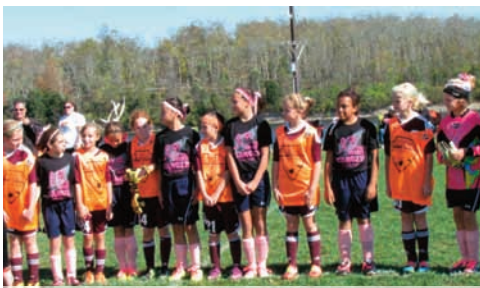
Both teams join together for the cause